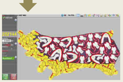
Marking defects, quality grades and auto nesting